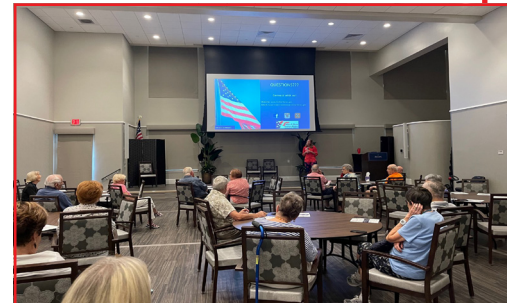
It was a pleasure to speak to the residents at Siena Lakes Senior Living Community about the upcoming elections!